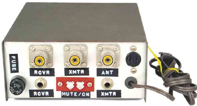
Figure 3—Rear view of the T/R switch.

the station controls at my left. When installing the toggle switches, it might be useful to use the Greenlee punch designed specifically for this purpose because the notch it creates inhibits shaft rotation. Most of the parts I used were out of my junkbox, but using new ones aids appearance. If low-impedance headphones are used, a matching transformer could easily be wired into the unit or used in an outboard capacity.