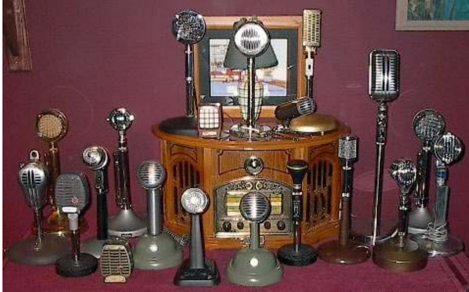
Vintage Classic Microphones http://k9toa.net/