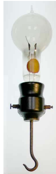
Edison lamp 1879