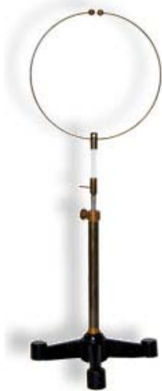
Hertz Resonator 1890