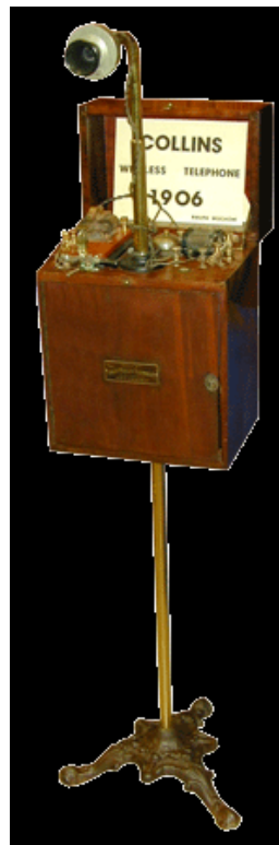
Early Collins Wireless Telephone