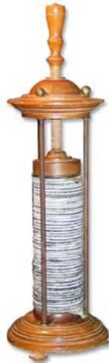
Volta Pile, early 19 th century